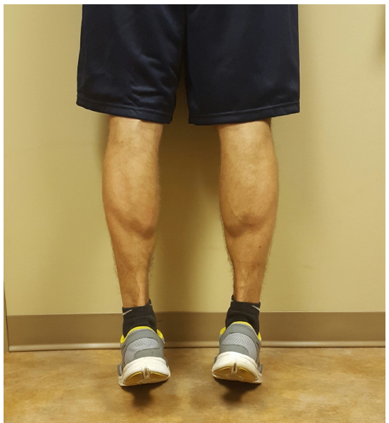
Ex: Calf Raises; use wall as needed for support