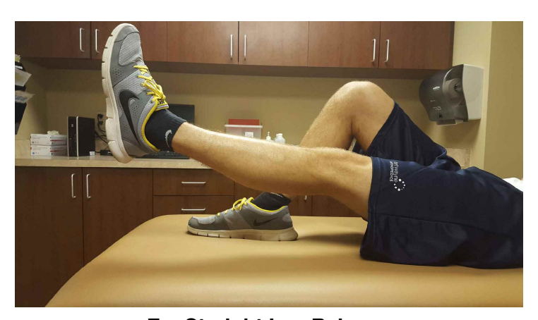
Ex: Straight Leg Raises