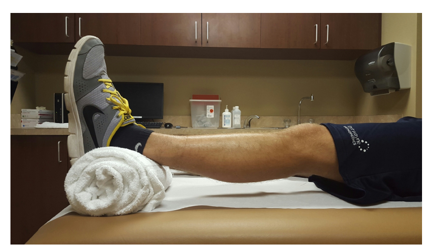
Ex: Heel Props